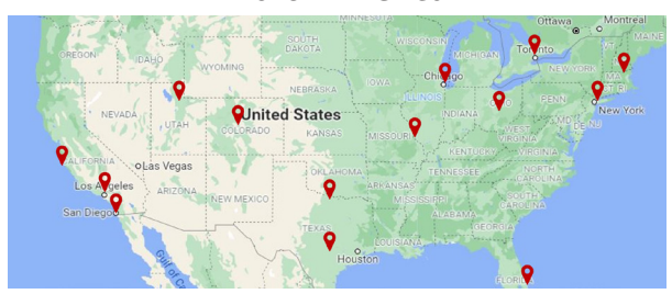
Austin • Columbus • Chicago • Los Angeles • San Francisco San Diego • Denver • Dallas • NYC • Boston • Miami St Louis, MO • Salt Lake City • Toronto