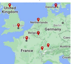
London • Edinburgh Copenhagen • Paris • Zurich Geneva • Amsterdam