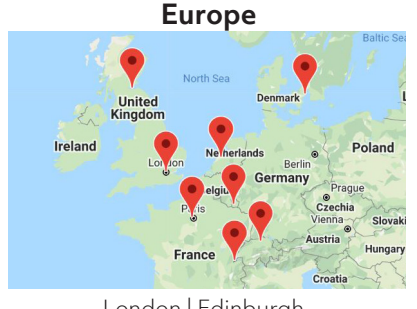
London | Edinburgh Copenhagen | Paris | Zurich Geneva | Amsterdam